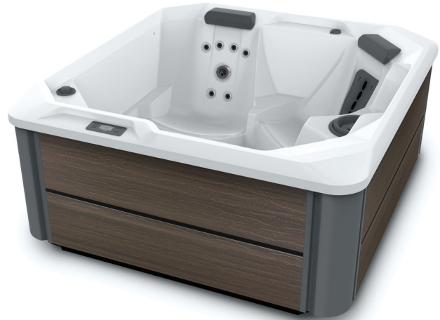
SX spa shown with Pearl shell and Havana cabinet.