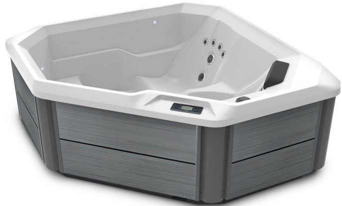
TX spa shown with Alpine White shell, and Storm cabinet.